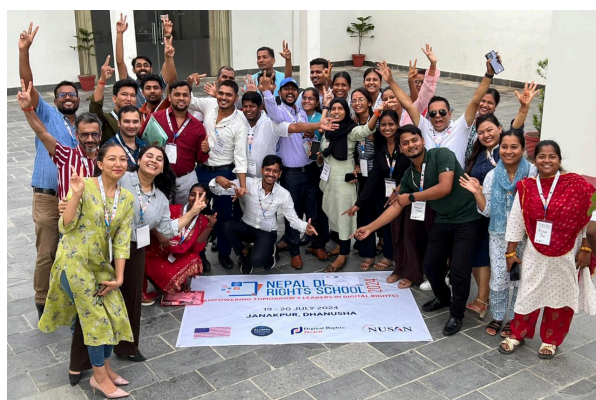
Digital Rights School at Janakpurdham, Madesh Province