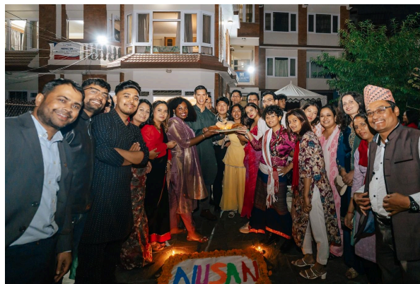
Tihar Celebration and Alumni Meet Up