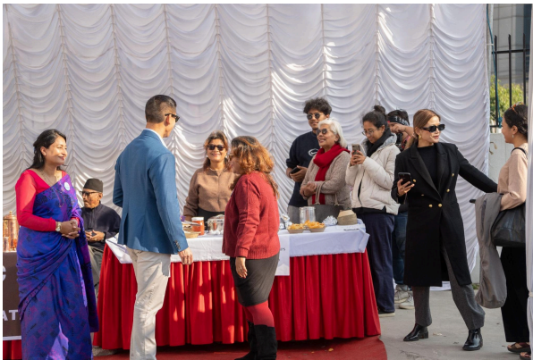
Stall Visit at NUSAN Entrepreneur Mela 2024