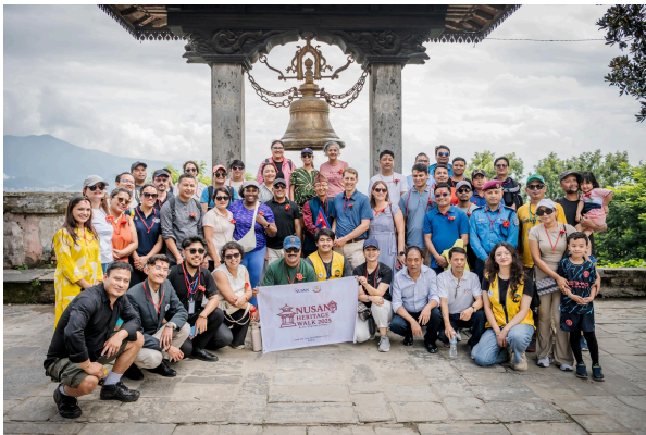
Group photo from NUSAN Heritage Walk