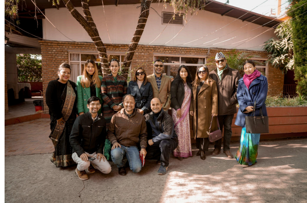
Photo from Sixth Annual General Meeting