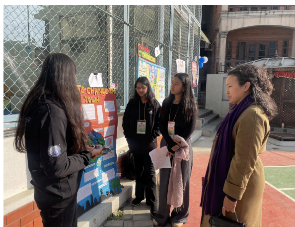
USG Exchange Alumni with World Climate Championship Participants