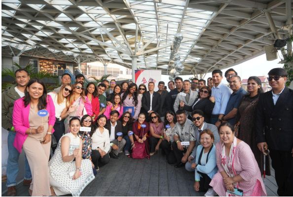
Alumni Meet and Greet in Celebrating Nepali New Year

relations and contributing to social change. The informal gathering fostered stronger personal and professional ties within the network.