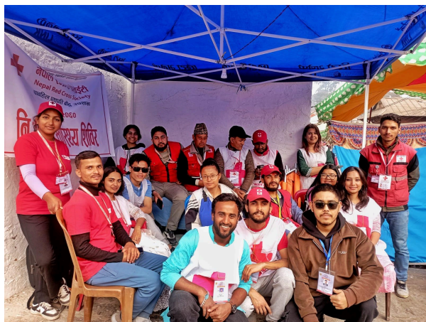
Free Health Camp at Pashupatinath