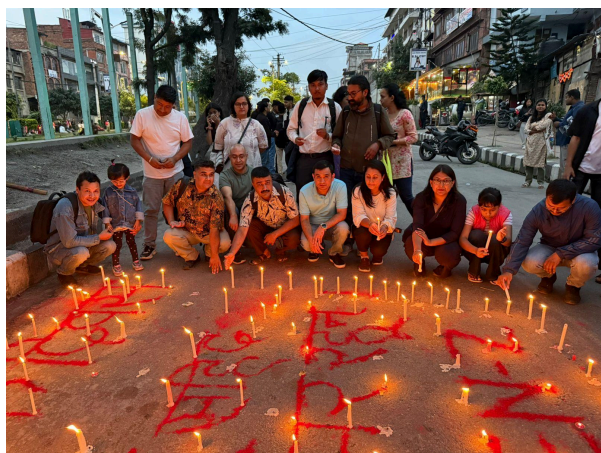
Candlelight Vigil for the Gen Z Movement