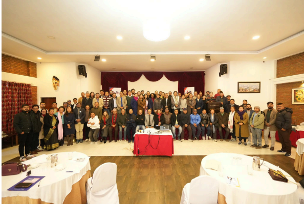
Group Photo from Sixth Annual General Meeting