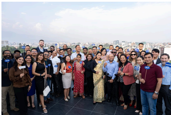
Alumni Meet and Greet 2024

To mark a new milestone with the establishment of the office space, NUSAN organized a Tihar celebration and alumni meet-up at its premises in Kalopul, Kathmandu. Around 40 USG Exchange Alumni took part in the Deusi Bhailo celebration with traditional music, food, and a warm, festive atmosphere. The event helped reinforce a sense of belonging within the network and allowed alumni to see the new office as a shared space.