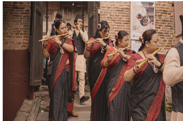
Cultural performance by the local community