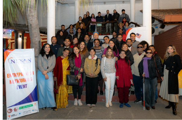
Alumni Networking Session