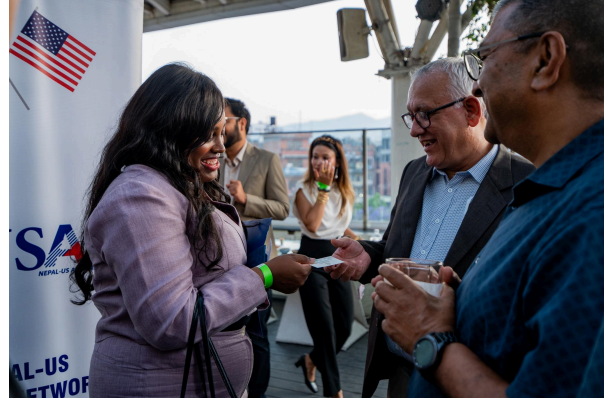
Networking with Cultural Affairs Officer, U.S. Embassy Nepal