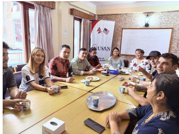
USG Exchange Alumni at NUSAN office