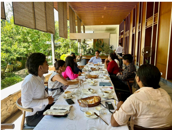
Engagement with the U.S. Embassy Public Affairs Team