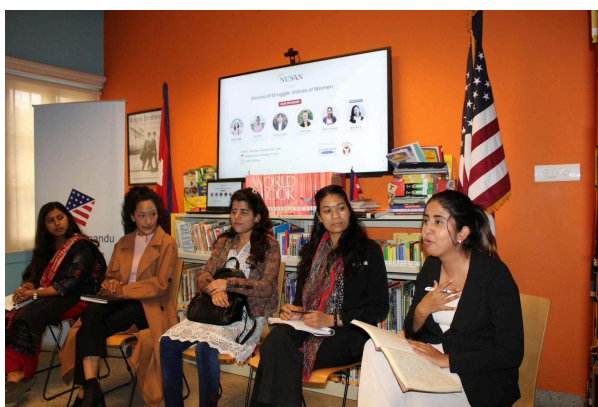
Stories of Struggle Session at Innovation Hub Kathmandu

Digital Rights Nepal, an AEIF grantee, partnered with NUSAN to deliver a series of Digital Rights School workshops across all seven provinces. The workshops were conducted in Surkhet, Dhangadi, Bhairahawa, Pokhara, Janakpur, Biratnagar, and Kathmandu between May and September. The program promoted digital literacy, safer online practices, and awareness of digital rights and responsibilities among youth. Alumni facilitators used their expertise to guide discussions on online safety, misinformation, privacy, and responsible digital citizenship.