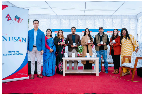
Panel Discussion at NUSAN Entrepreneur Mela 2024