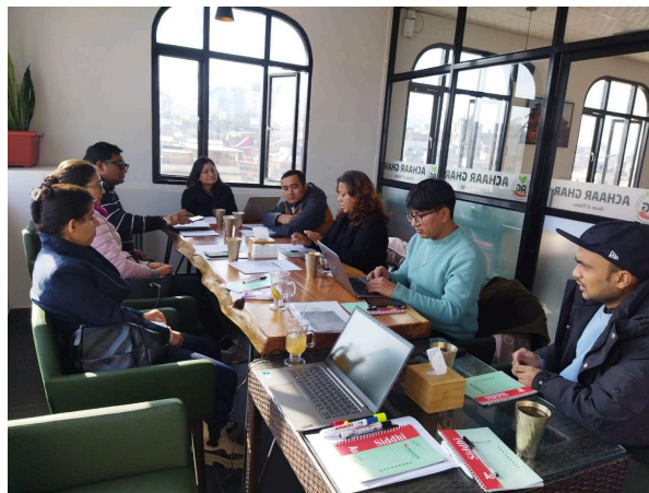
Strategy Meeting of the Executive Committee