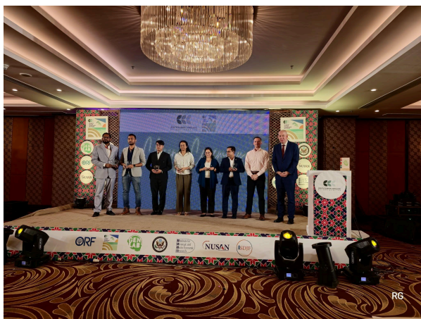
Photo from South Climate Conclave Sylhet Chapter