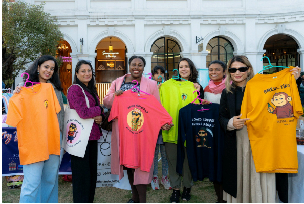
USG Exchange Alumni Stall Visit