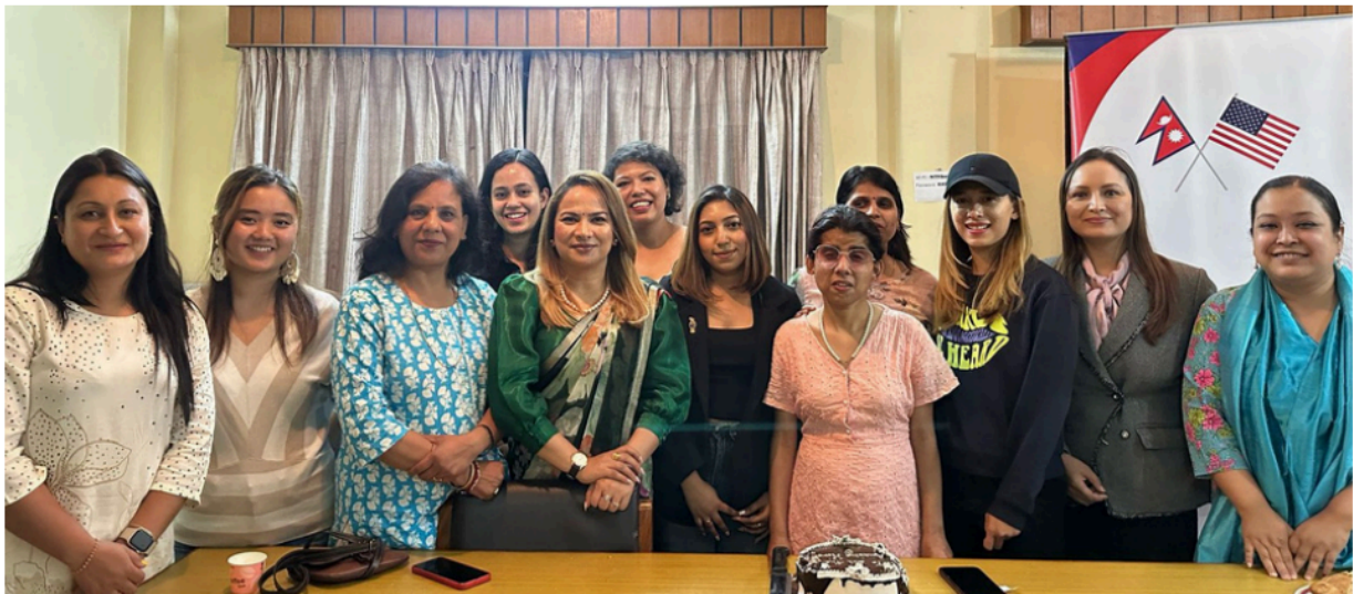
USG Exchange Women Alumni at NUSAN Office