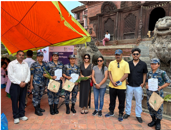
Blood Donation Program at Basantapur Durbar

On 11 July 2025, NUSAN marked its seventh anniversary with a blood donation program at Basantapur Durbar Square in collaboration with Rotary and Lions Clubs. With support from Green Valley and Green Nepal, saplings were also distributed to participants. The celebration concluded with a gathering of Executive Committee members and alumni, reinforcing NUSAN's identity as a network committed to both community service and alumni solidarity.